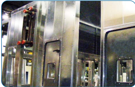
38,000 cfm Ventrol knock-down AHU is fully assembled, tested, and inspected at the factory.

Once the medical center gave the "thumbs up" to the knock-down air handler with a FANWALL array solution,