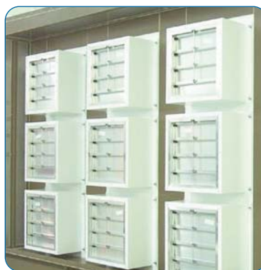
Intake side of a 3x3 FANWALL array showing the backdraft dampers to isolate the fans when turned off.