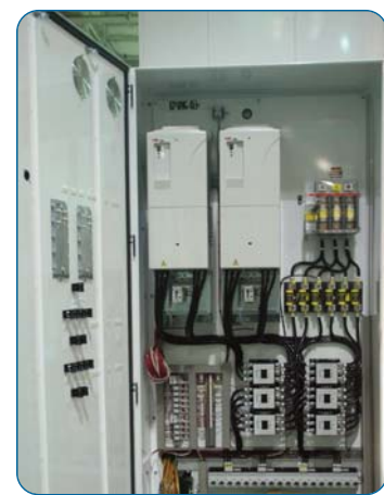
Fan speed is controlled by a variable frequency drive. A bypass option serves as a backup control option. Control panel comes pre-wired from the factory for unit or remote mounting.