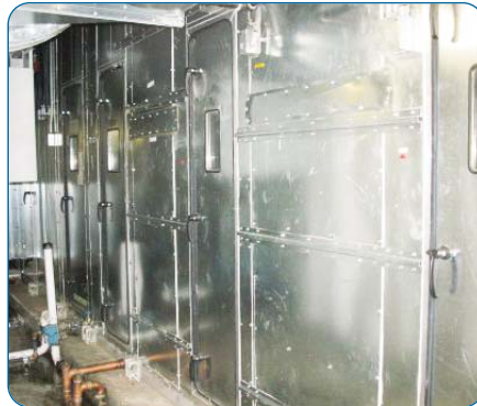
Assembled 38,000 cfm Ventrol AHU that was brought into a tight quartered equipment room through a 60-inch square opening.

Any build-up of surface condensation caused by a variance between ambient air and conditioned air can produce HVAC problems. Ventrol eliminated the possibility of such problems by building the air handler with hybrid foam thermal break technology consisting of fiberglass and foam with a R-18 value.