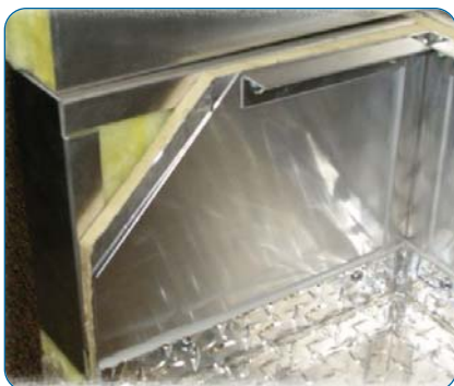
Ventrol's thermal break design with hybrid foam insulation ensures metal that is exposed to the cold side of the panel is separated from the warm equipment room side preventing condensation.