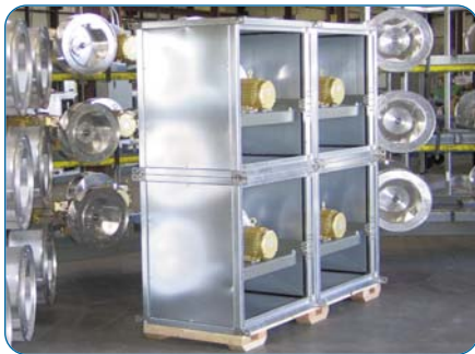
FANWALL cells ship on pallets so they can be individually moved into the building avoiding costly demolition. The motors are pre-wired at the factory for quick installation.