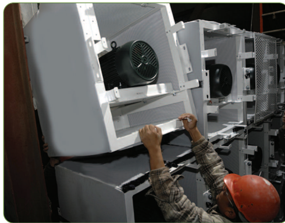
FANWALL® cells stacked on one another to form an array.

According to Karpinen, "We were able to remove the custom sound traps, operate at a higher airflow rate and static pressure, and still see a reduction of 35 hp in fan horsepower."