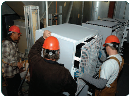
FANWALL cells are easily stacked together to form a 5x3 array.

The FANWALL modules, which are capable of passing through standard width doorways, were small enough to fit into position without major building demolition. The project required construction of a platform (see page 4) and a reconfigured plenum and duct system such that with quick removal of a few panels, the new system could temporarily flow air through and later around the existing vaneaxial fan until it could be removed. At a later date, the old fan was then dismantled and removed in increments after the new fan system was on line.