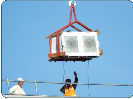
FANWALL cells are lowered by crane into the penthouse equipment room.

The challenge facing engineer Barney at the facility was to eliminate the risk that went with a fan failure which could effectively shut down the entire patient tower. With a novel design approach, this conversion was accomplished with no interruption of patient service or comfort. What turned out to be the innovative solution was two FANWALL® multiple fan arrays that were moved into place and installed one unit at a time while the original fan stayed in service (see page 4).