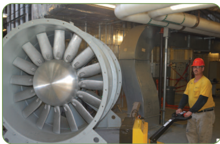
Existing 250 hp fan was a single vaneaxial type similar to the one shown here.

In recent years it had become a matter of growing concern to Barney that the air handling system that served all the patient rooms, and many of the treatment suites in the hospital, was served by a single 139,000 cfm vaneaxial fan, operating at 6.9 inches of total static pressure. The single fan motor is rated at 250 hp, and weighs 2,500 lbs. The system was installed when the medical center was built in 1996. A variable pitch blade design allowed airflow adjustment. Barney notes that the fan and its drive motor had not yet given any problems.