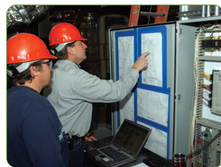
The FANWALL control system is easily integrated into the existing Siemens Talon building automation system.