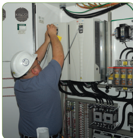
Fan speed is controlled by one variable frequency drive with another drive for standby due to the critical nature of the application. Control panel comes prewired from the factory.