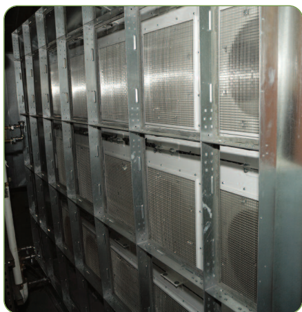
Inlet side of one 5x3 FANWALL array with inlet screen shown. Screen helps to reduce preswirl of air entering the fan and reduces sound levels.

According to Barney, the removal of the fan and motor was then done during times when only minimal airflow was required and the crews could work within