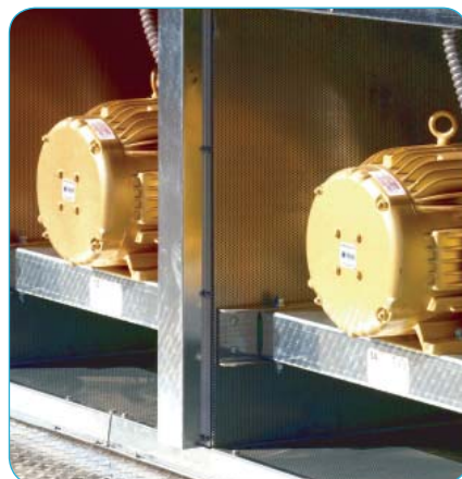
2 x 2 FANWALL array for supply and return fans reduces unit footprint