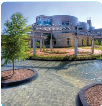
Outside view of Dell Garden

"The FANWALL is quiet – hardly noticeable," adds Risner.