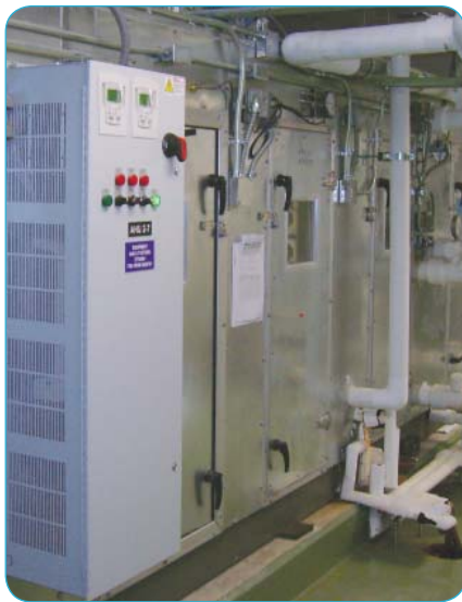
Temtrol air handler with FANWALL system with VFD control panel for modulating fan speed.