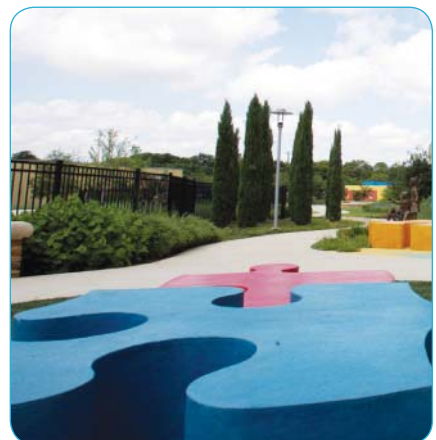
Outside bench puzzle pieces at Dell