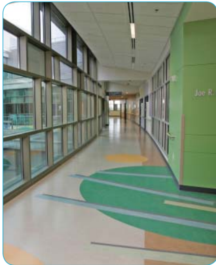
Hospital design utilizes natural lighting and on-site natural gas plant generates electricity and chilled water from waste heat.